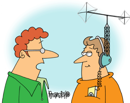
"A ham - pod?"